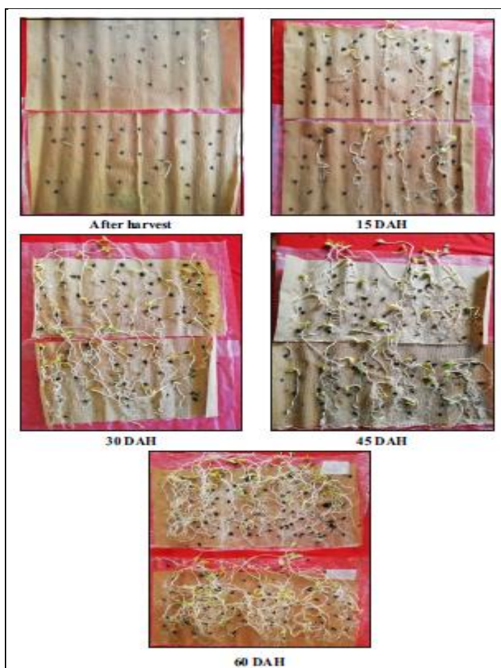
Plate 1. Seed germination percentage at immediately after harvest, 15, 30, 45 and 60 DAH in hybrids derived from diverse CMS sources in sunflower